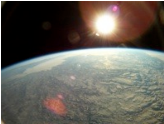
EXPLORE captured extraordinary video material from the rocket flight

During the flight EXPLORE showed perfect communication with the rocket and all housekeeping data, including temperature and pressure values, as well as the status of the experiment controllers were received. However, the greatest relief and pride came with the analysis of the video material EXPLORE captured during the flight. The experiment featured two cameras, one looking inside and one looking outside the rocket module, both recording impressive HD imagery. These videos fully rewarded the team for their hard work in getting the experiment ready for the flight. As a matter of fact, even the rocket experts were stunned by the quality and detail of the video material.