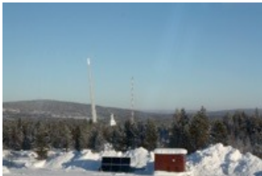
REXUS 9 launch on 22 February 2011, 13:50 hrs from Kiruna

The team met again for an intensive launch campaign at Esrange Space Center between 14 and 25 February, together with eight other international student teams. The first week of this launch campaign was filled with careful preparation and thorough testing of all experiment modules together with their rocket service systems to ensure flawless flight operation. This included multiple test countdowns to check all procedures and potential glitches during the real “hot” countdown that was planned for the second week. On launch day, the tension was high with students and rocket experts. But after a first launch delay, everything went smoothly and the REXUS 9 launched from Kiruna on 22 February 2011 at 13:50 hrs towards the edge of space,