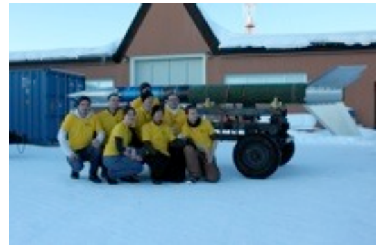
EXPLORE Team in front of the REXUS rocket at roll-out

carrying EXPLORE and three more student experiments. Its sister rocket, REXUS 10, followed only one day after, with a successful flight on 23 February 2011, carrying another four student experiments. The flights of REXUS 9 and 10 reached altitudes of 80.6 and 82 km, respectively, lasting a little more than 13 minutes each, including about 3 minutes of microgravity. After parachute descent, it took the recovery team about two hours to locate the experiment modules from the helicopter and to take them back to the eagerly waiting students for the post-flight analysis.